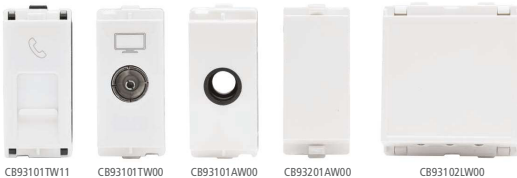
CB93101TW11 CB93101TW00 CB93101AW00 CB93201AW00 CB93102LW00