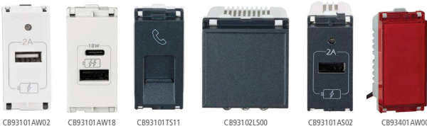
CB93101AW02 CB93101AW18 CB93101TS11 CB93102LS00 CB93101AS02 CB93401AW00

USB Charger conforms to IS 13252 (Part 1)