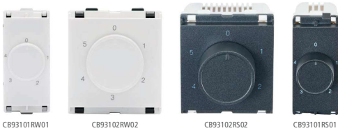
CB93101RW01 CB93102RW02 CB93102RS02 CB93101RS01