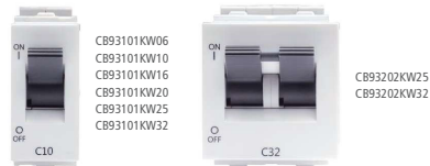
CB93101KW06 CB93101KW10 CB93101KW16 CB93101KW20 CB93101KW25 CB93101KW32 CB93202KW25 CB93202KW32

USB Charger conforms to IS 13252 (Part 1)