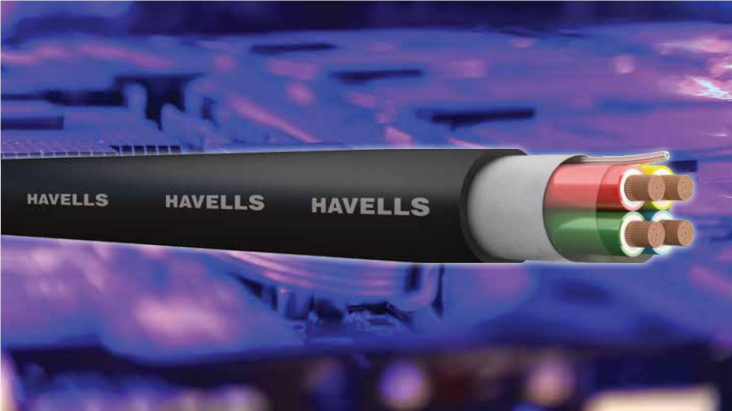
Havells 1100 Volt Flexible ABC Conductor, PVC Type D Insulated, Cores laid up, Overall Shielded by Al-mylar along with ATC drain wire & Overall PVC Type ST-3 Sheathed Cable HSN CODE: 8544