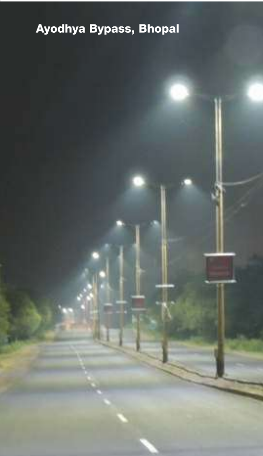
Ayodhya Bypass, Bhopal